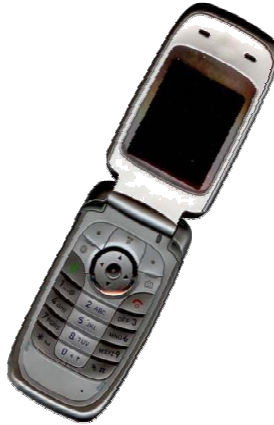
Fig.3 Example of an image with acceptable resolution