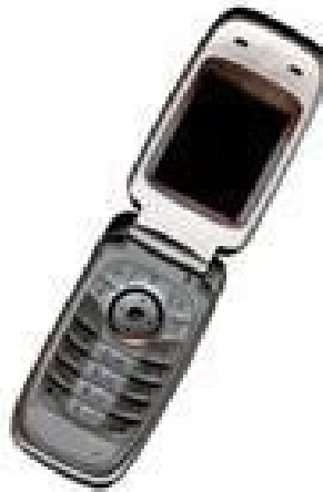
Fig.2 Example of an unacceptable low-resolution image

Figures must be numbered using Arabic numerals. Figure captions must be in 8pt Regular font. Captions of a single line (e.g. Fig.2) must be centered whereas multi-line captions must be justified (e.g. Fig.1). Captions with figure numbers must be placed after their associated figures, as shown in Fig.1.